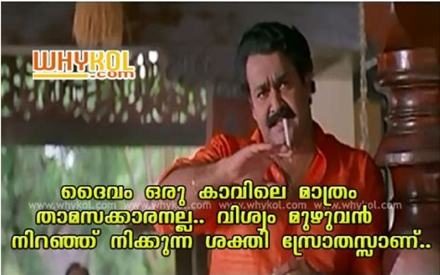
ദൈവം ഒരു കാവിലെ മാത്രം താമസക്കാരനല്ല.. വിശ്വം മുഴുവൻ നിറഞ്ഞത് നിന്നുന്ന് ശക്തി സ്രോതസ്സാണ്..