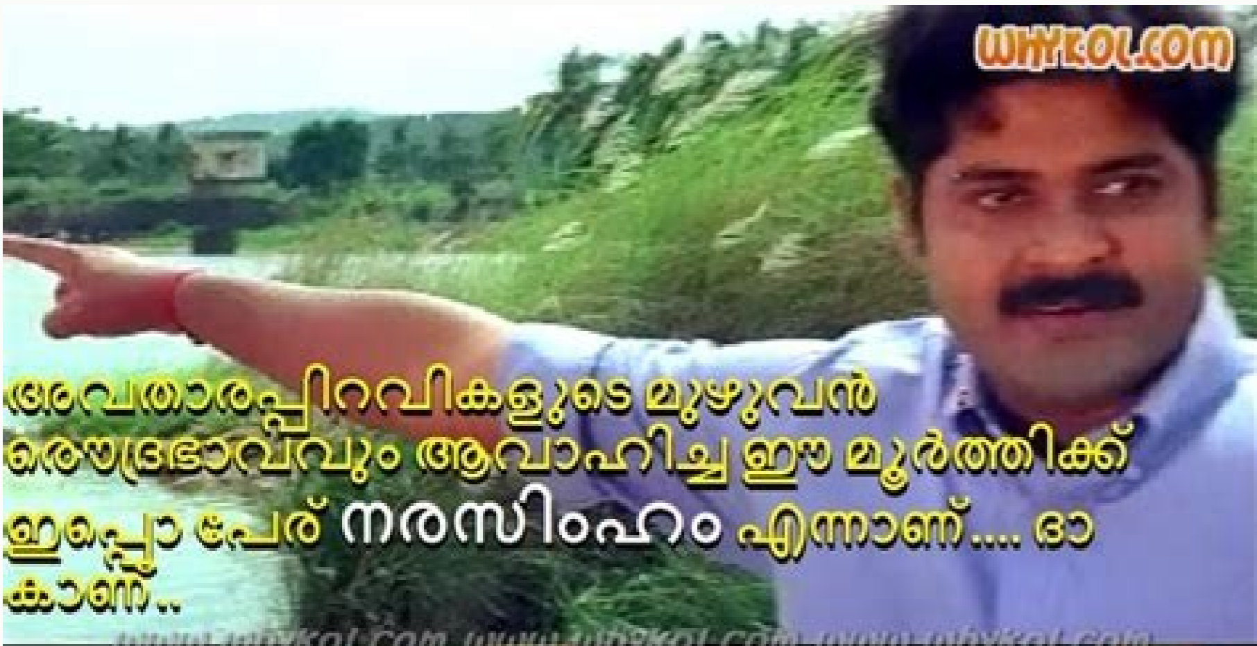
അപരാധിനികളുടെ മുഴുവൻ ശൗഭ്രാവവും അവഹിച്ച് ഈ മുർത്തിക്ക് ഇപ്പോ പേര് നരസിംഹം എന്നാണ്.... ഓ കാണൂ..